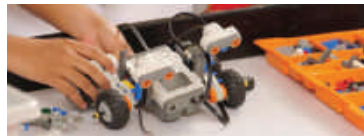
Developing Confidence by adapting Emerging Technologies

K. R. Mangalam World Schools endeavour is to transform the education system where the overall impetus is on skill-based curriculum and competency based pedagogy to make sure that learners are actively and joyfully engaged in the learning process.