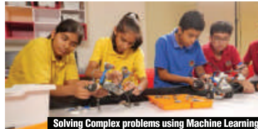
Solving Complex problems using Machine Learning

Moving from strength to strength, we are now a strong community of more than 7500 students and parents. The School campuses are environmentally cautious and pollution-free properties adorned with lush green fields and host a rainwater harvesting system. All their schools promise a comfortable and secure space for students to learn, perform and develop.