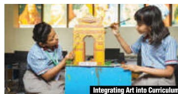
Integrating Art into Curriculum

For more details, visit: www.krmangalam.com