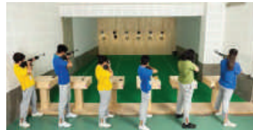
Learning to be Focused and Consistent

The schools focus on STEAM education which produces creators, thinkers, problem solvers, doers, innovators, and inventors. K. R. Mangalam World Schools follow an interac-